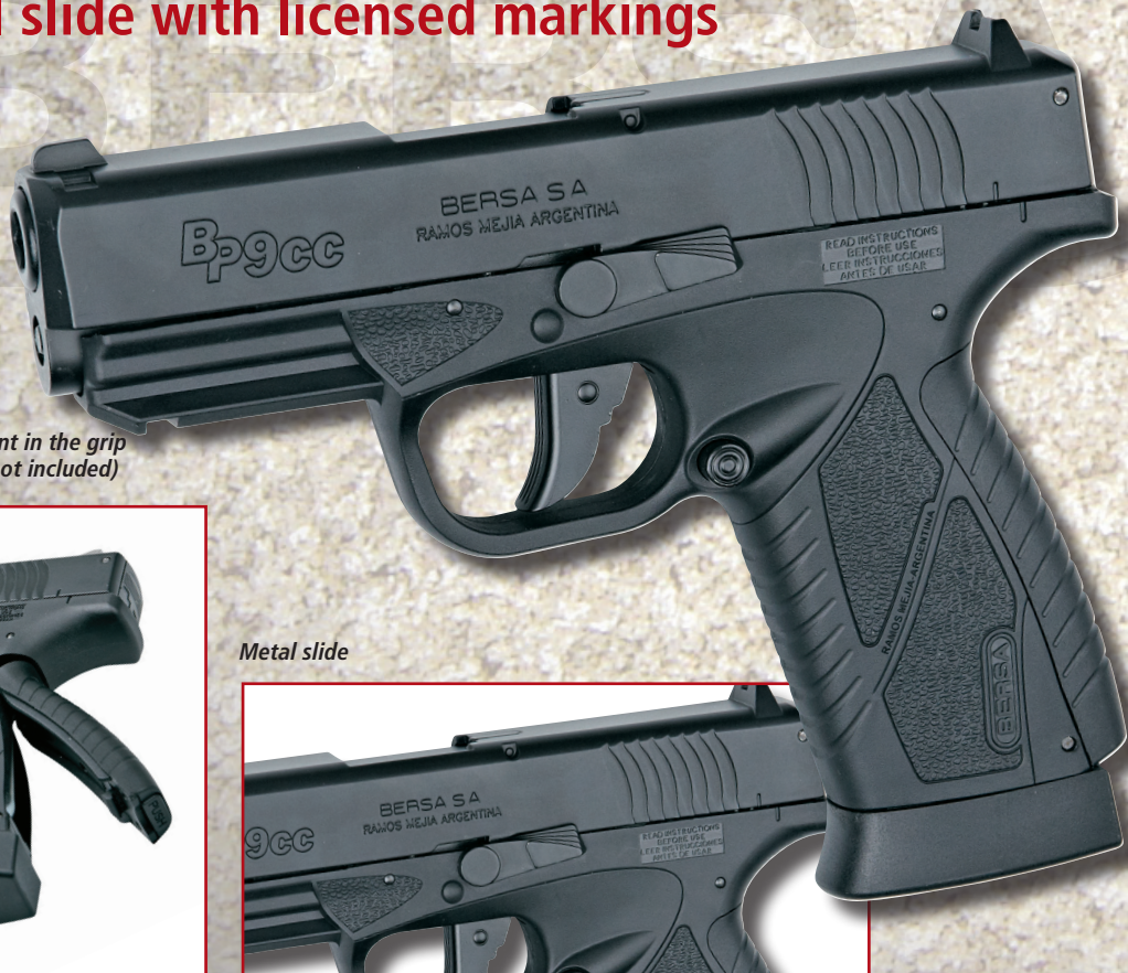
CO 2 compartment in the grip (CO 2 cartridge not included)